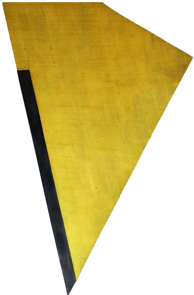
Bernadette Bour Sans titre , 1992 free canvas stitched 240 x 162 cm Signed back INV Nbr. BB1992_04