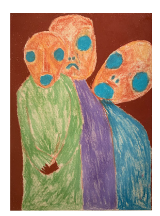
Untitled n°29 1980 Oil pastel on paper 48 x 38cm