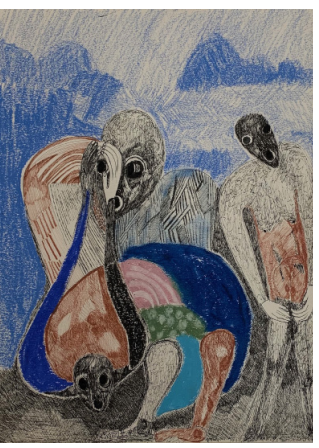
17 September 1980, n°36 1980 Ink on paper 36 x 27,5 cm