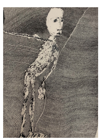
19 November 1989, n°45 1989 Ink on paper 36 x 27,5cm