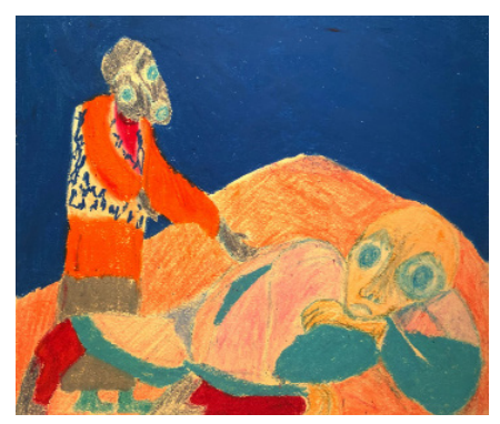
Untitled n°30 1980 Oil pastel on paper 38 x 48cm