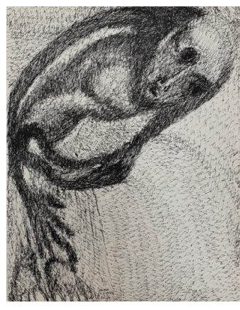
10 May 1983, n°59 1983 Ink on paper 36 x 27,5cm