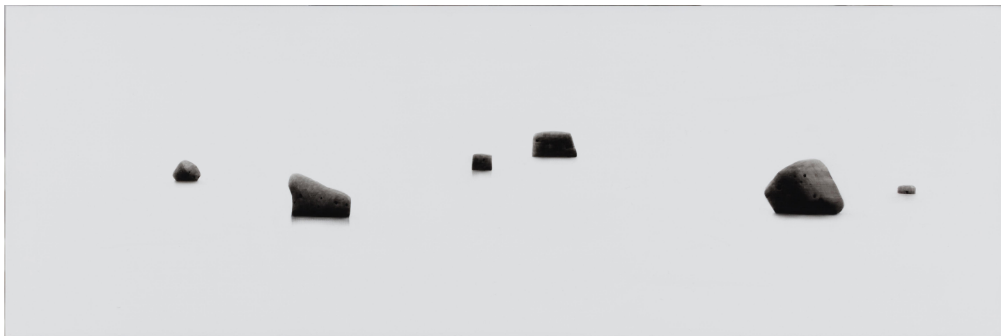
Choi Jun-Kun Sea , 2016 Chinese ink on canvas 30 x 90 cm INV Nbr. CJK2016_21