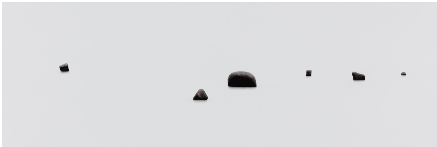
Choi Jun-Kun Sea, 2016 Chinese ink on canvas 50 x 150 cm INV Nbr. CJK2016_9