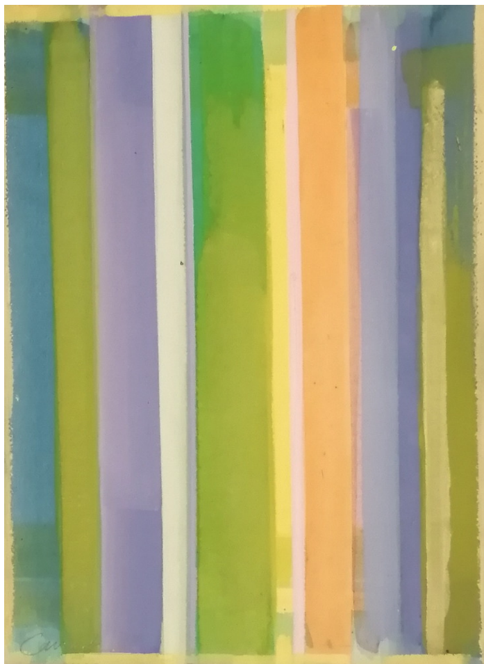
Michel Carrade Sans titre , circa 2000 Gouache sur papier INV Nbr. MC2019_06