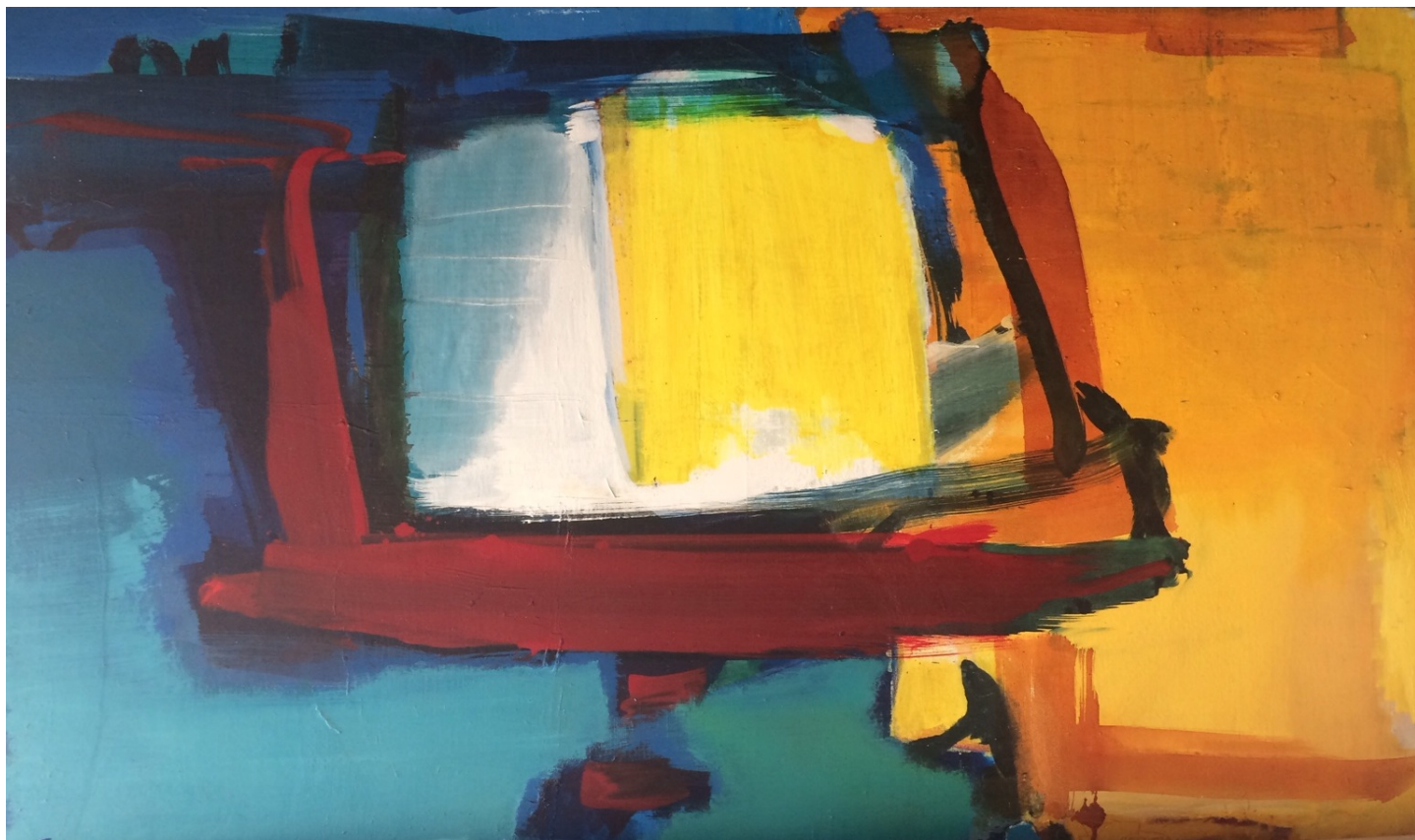
Michel Carrade Sans titre , 1965 Oli on canvas 194 x 113 cm INV Nbr. MC1963_01